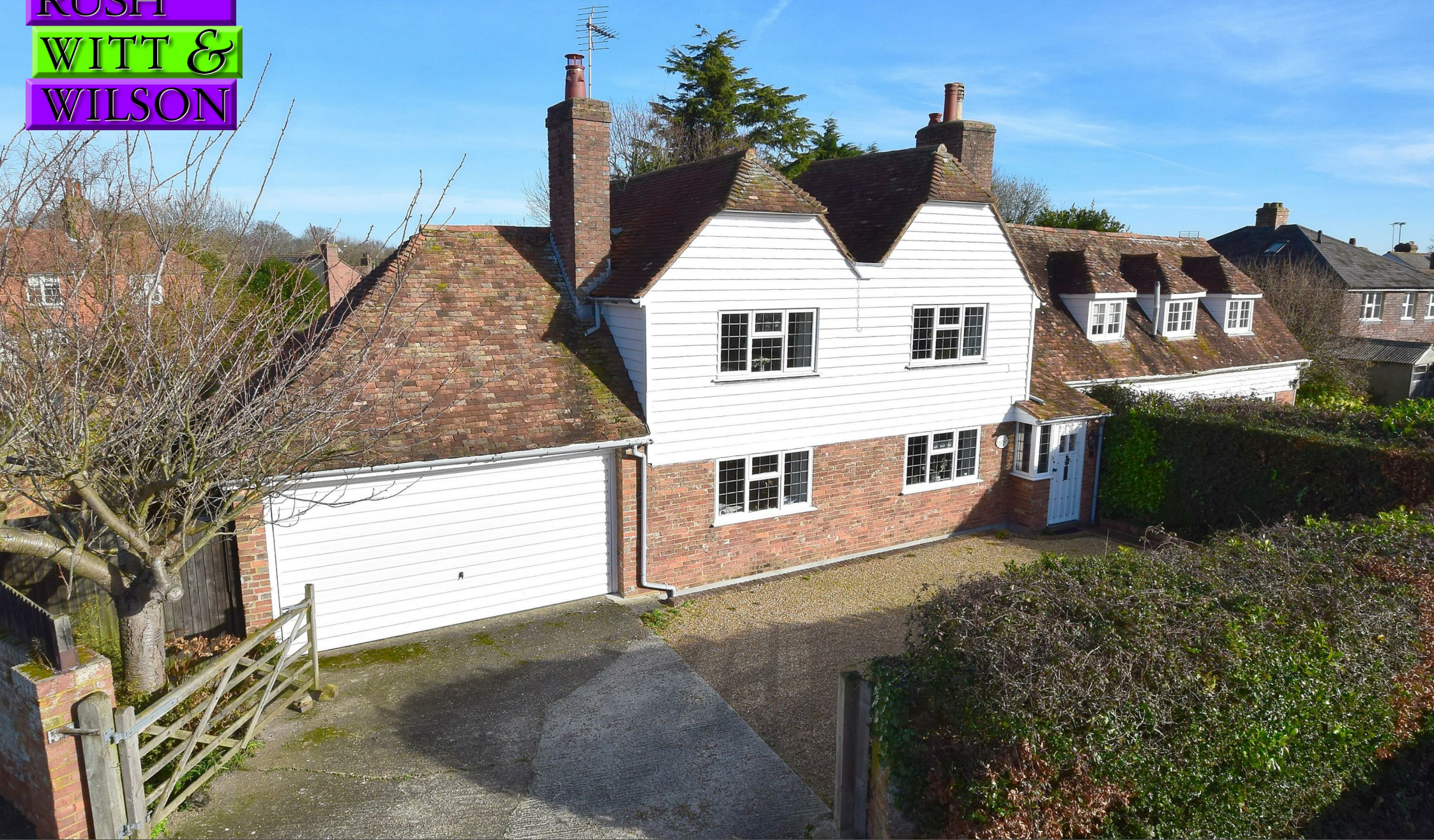
Chennel Cottage The Pavement, St. Michaels, Tenterden, Kent TN30 6DR Guide Price £595,000